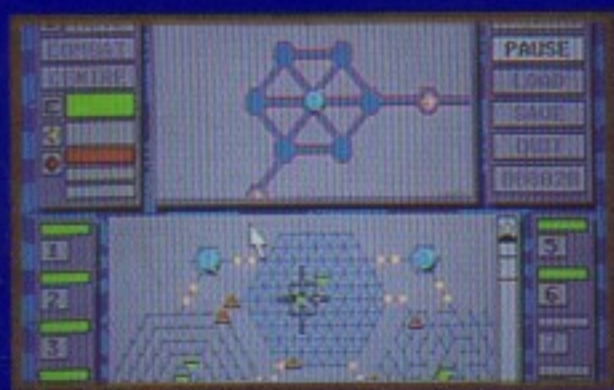
The contest begins. Unit 1 prepares to leave the safe zone...