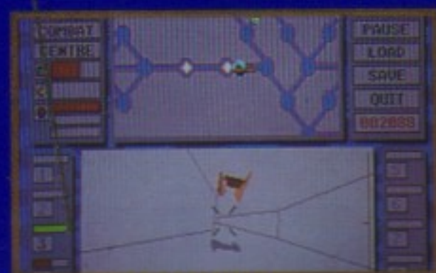
Under attack... In 3D Combat Mode, your Skimmer gets ready to attack an enemy Cycloid.