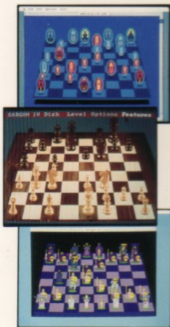
Actual IBM and Macintosh screens