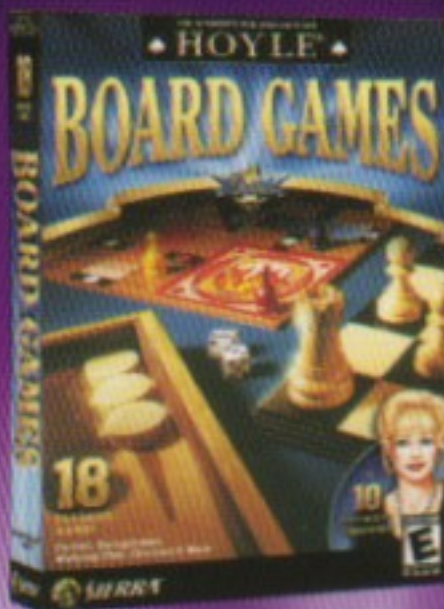
Hoyle® Board Games