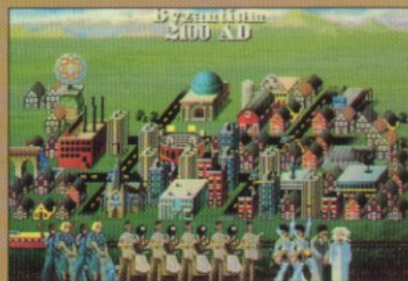
IBM screen shown.