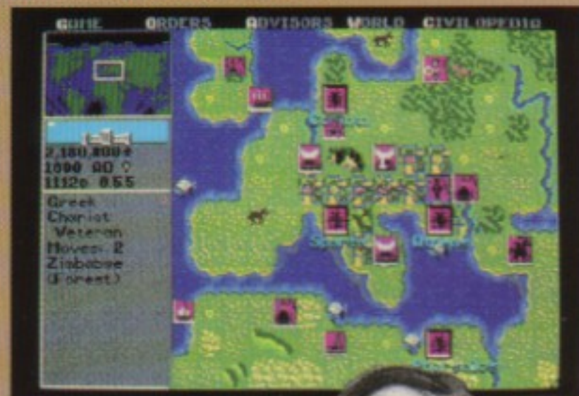
Amiga screen shown.