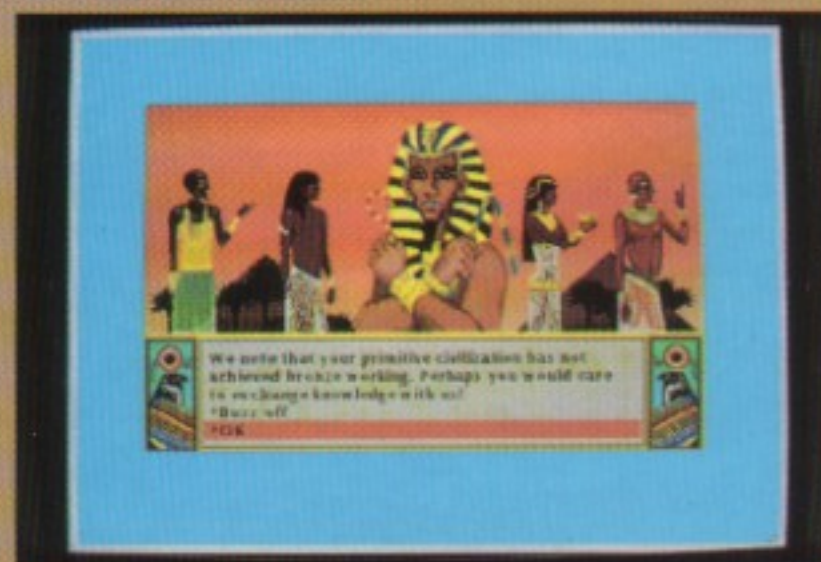
Macintosh screen shown.