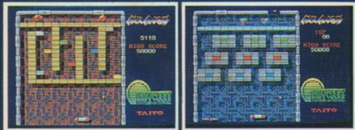
Amiga™ version shown

The #1 Coin-Op Game has come home, offering the breathtaking animation, digitized sound, and dazzling game play you've been seeking!